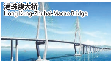
港珠澳大桥 Hong Kong-Zhuhai-Macao Bridge