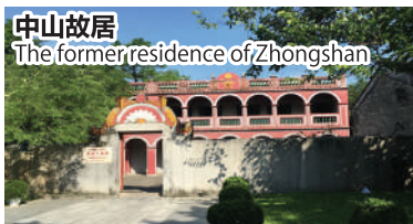
中山故居 The former residence of Zhongshan