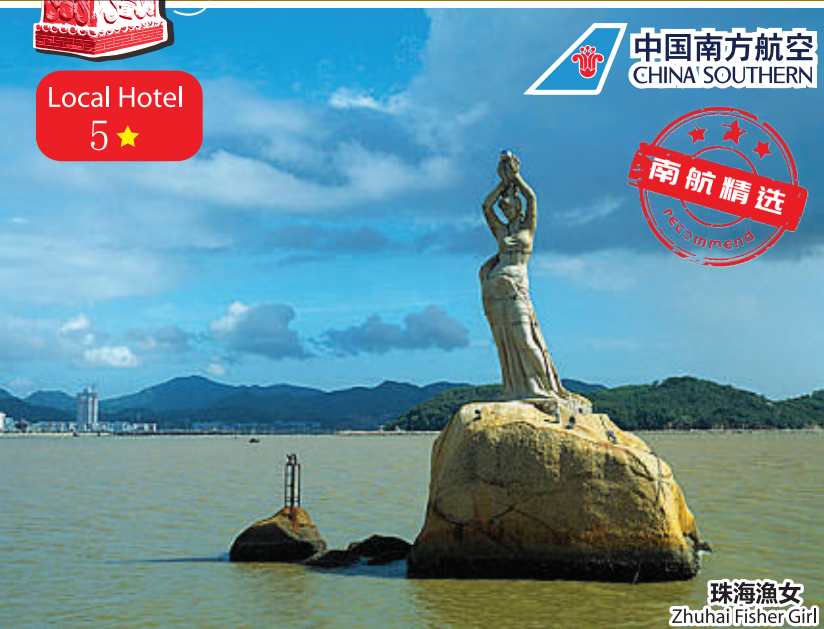
珠海漁女 Zhuhai Fisher Girl